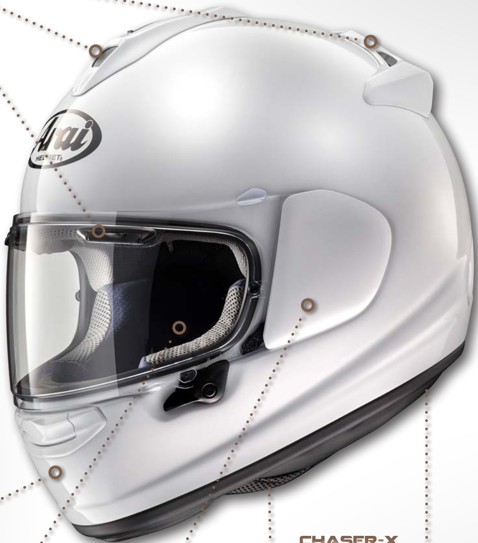
CHASER-X Diamond White

** Innovated and exclusively offered by Arai